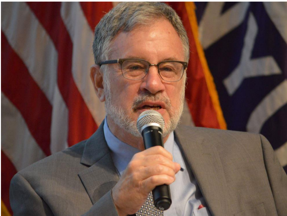
Walter Ruby Photo Courtesy Walter Ruby