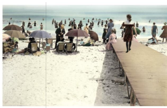
The Beach at Beach Haven