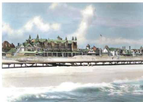
Baldwin Hotel/Boardwalk, Beach Haven Beachgoers on the Fortuna, Ship Bottom