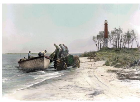
Fishermen Unloading Nets at Barnegat Inlet